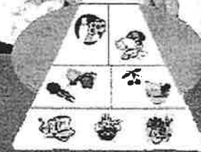
Shasta Food Group

Emergency Food Banks & Assistance Programs